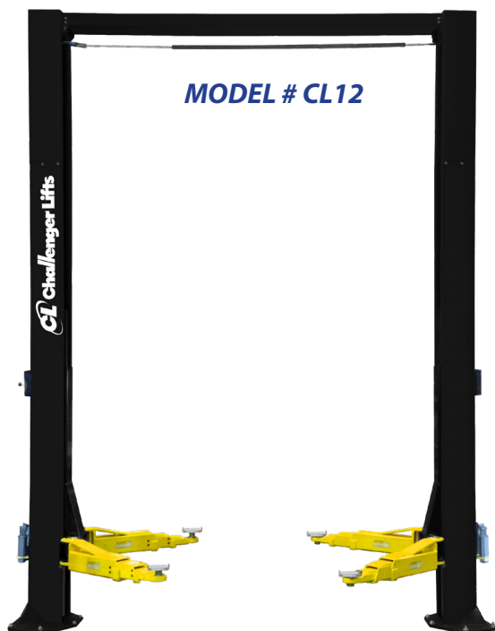
MODEL # CL12