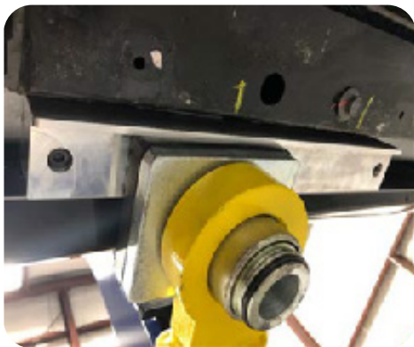
Part# TFPK (under car view)