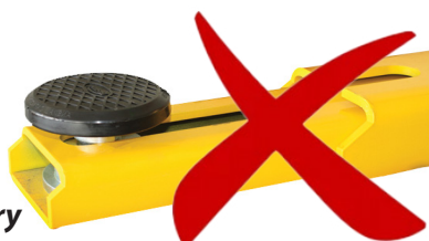
Arm corner interferes when removing battery

ROTUNDA CONTACT INFO: rotunda@service-solutions.com