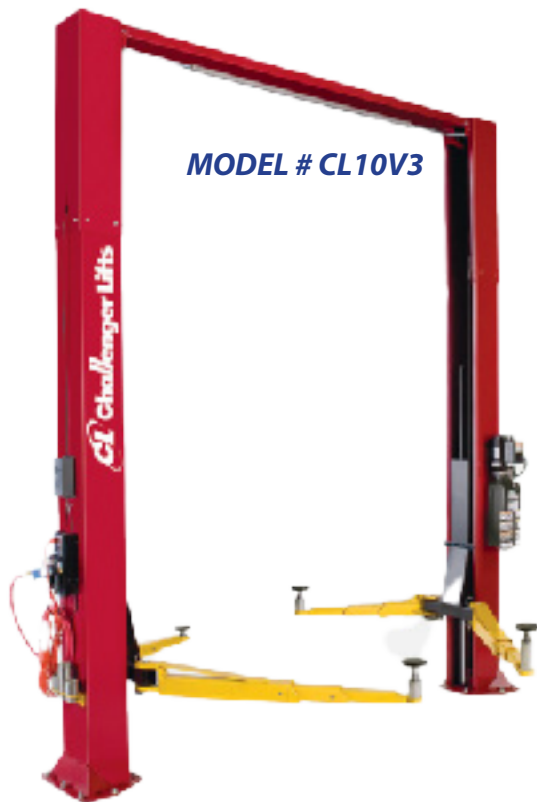
MODEL # CL10V3