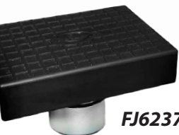
FJ6237 ADAPTER for SPOA10 / SPO10 / SPO12